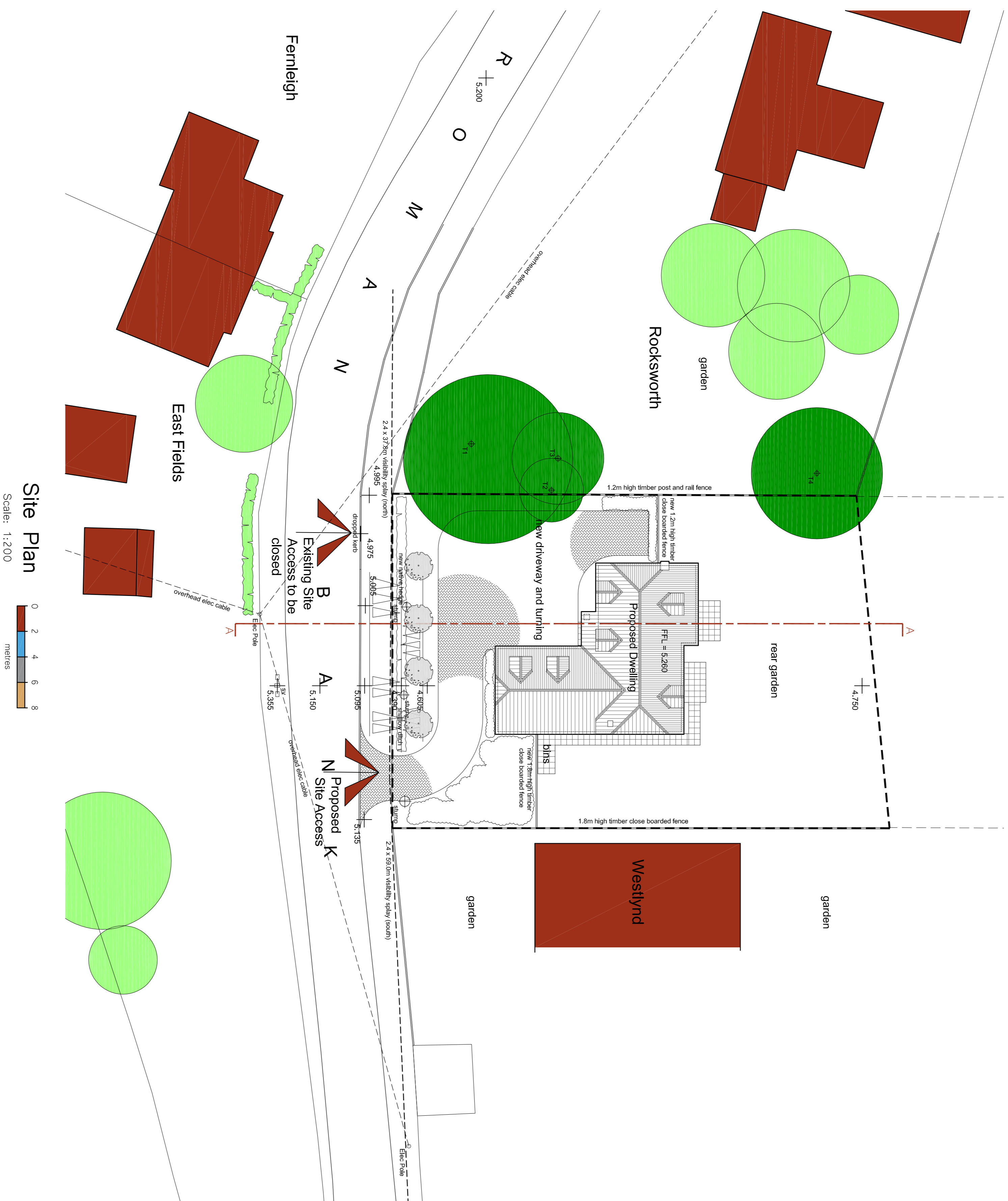
Site Plan Scale: 1:200